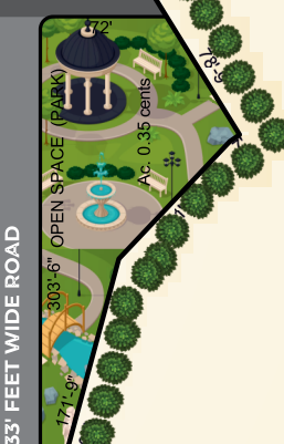
OPEN SPACE (PARK) Ac. 0.35 cents