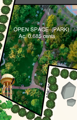
OPEN SPACE (PARK) Ac. 0.685 cents